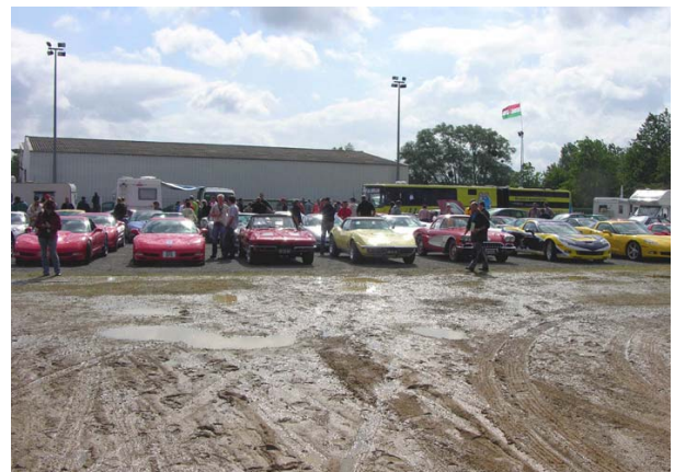
Cars queued for track lap