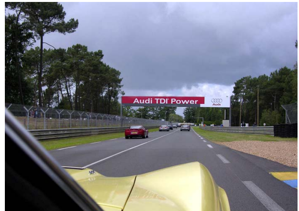
On the back side of the straight.