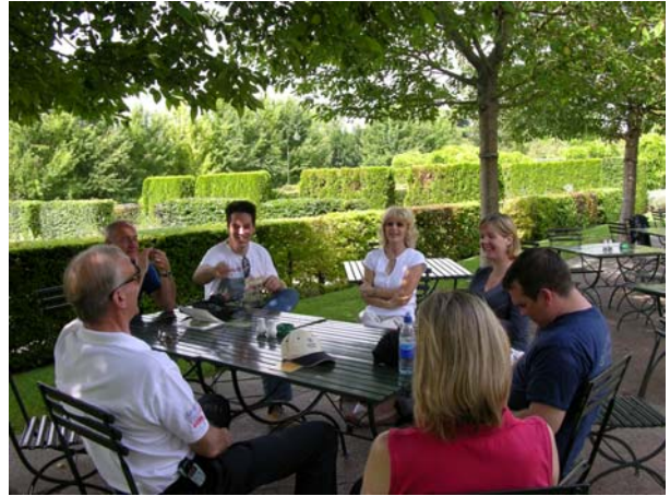
Monet's American Gardens

The next morning, the ladies decided we needed a culture break from nuts, bolts and carburetors. We made a mid-morning stop at the American Gardens, the home base of world famous painter, Claude Monet. The gardens he immortalized in his impressionist paintings have been maintained JUST as they were when he originally captured them on canvass.