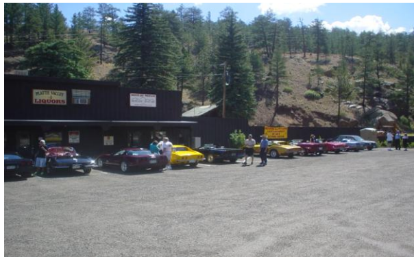
At 10:45am, waiting for the liquor store to open

You will notice that the next NCRS BOD will be on Friday after the National Convention in St. Charles. If you wish to attend, it is open to all members.