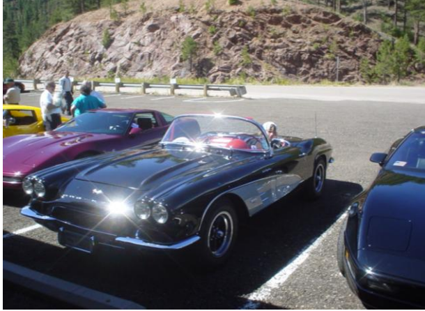
"Dream on buddy"